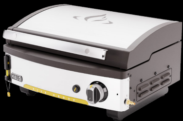
Elite Outdoor Griddle