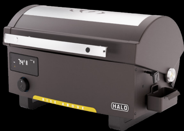
Prime Pellet Grill