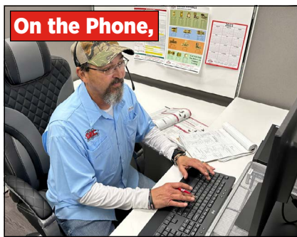
On the Phone,