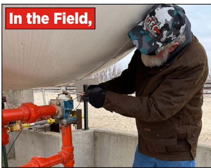
In the Field,

Since 1937, GEC has been providing dependable equipment supported by knowledgeable people in the field, exceptional customer service on the phone and, in recent times, 24-hour access via our online web store.