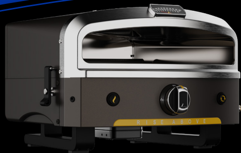
Versa 16 Pizza Oven